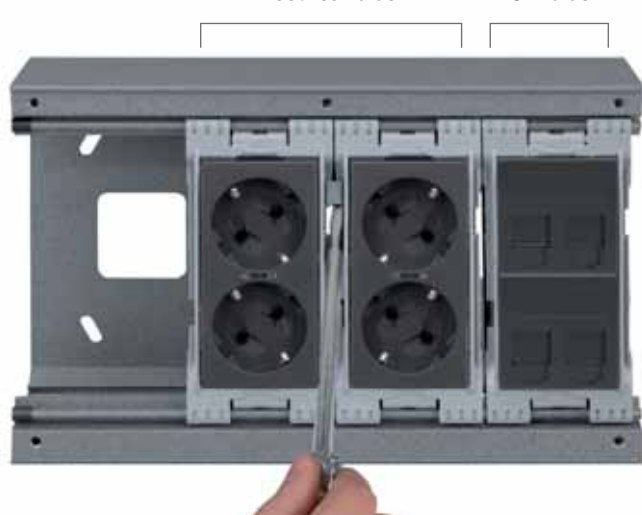
Electrical block V&D block

The centre frames snap to the section and form blocks using interlinked parts, thereby separating the electrical part from the V&D part.