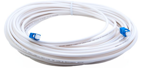
Patch SPX 1xSC/UPC-SC/UPC 20m

Kablagen är vita, halogenfria enligt IEC 60754-1/2 och flamskyddade enligt IEC 60332-2-2 och IEC 60332-3-24. De är ID märkta med ett unikt nummer för full spårbarhet samt levereras med individuella mätprotokoll.