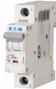
Miniature Circuit Breaker (PXL Series)