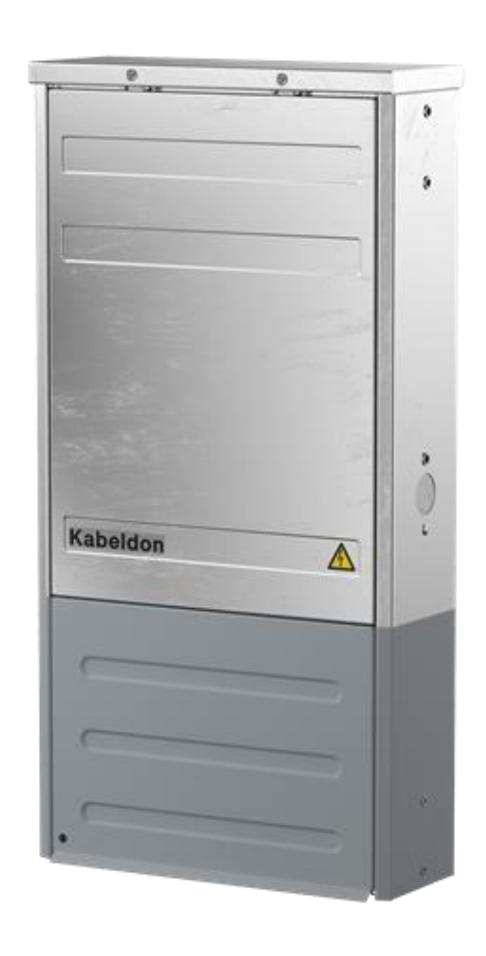
ABB Cable distribution cabinet CDC640