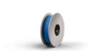
Figure 1: T2Blue+ product image

Note that the higher the cable is positioned in the floor construction, the more energy efficient it is to regulate the cable. T2Blue+ is the ideal floor heating system for installations in newly constructed buildings as well as for renovations. The cable exists in 2 power output variants of 7W/m and 12W/m and available in pre-terminated lengths (10-180 m). The range is composed of installer friendly kits including the cable on a spool and all installation accessories. Variants with or without touchscreen programmable, WiFi-enabled thermostat are available. The range of products is EcoDesign compliant when used in combination with one of the Raychem programmable thermostats.